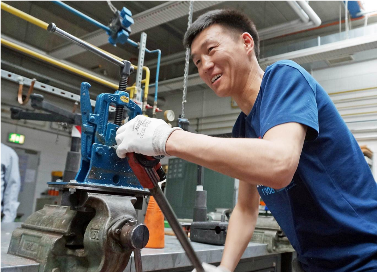
Human capacity development (HCD) measures in Mongolia